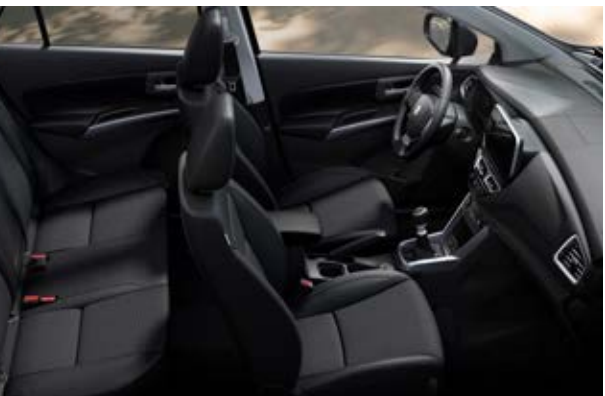
Spacious Cabin Ample room in both the front and rear seating areas make for a relaxing and enjoyable driving experience.